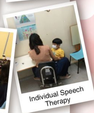
Individual Speech Therapy