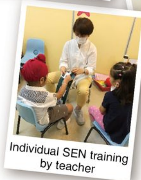
Individual SEN training by teacher