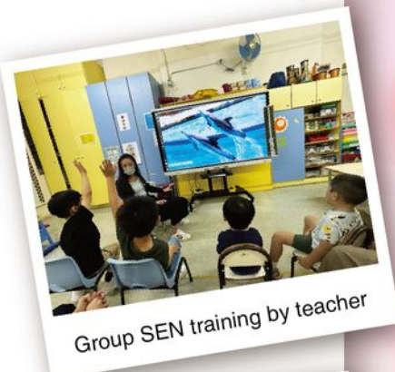
Group SEN training by teacher

The donation box for fundraising of "Watchdog" was placed at the reception of the DBRC. Each donation can help children with special educational needs, supporting them in overcoming learning difficulties and bringing smiles to their faces. Your generous contributions will serve as a source of hope and happiness for them.